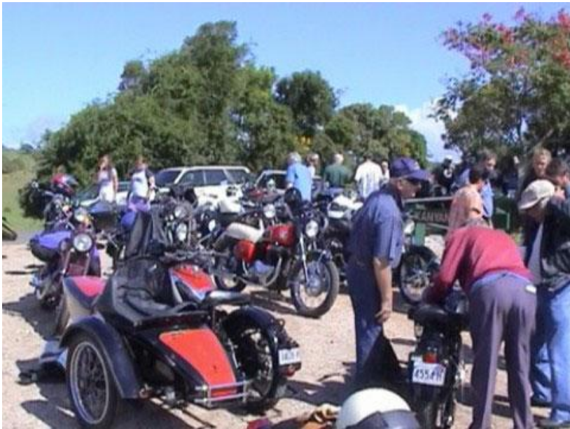
Resting for Re-Grouping