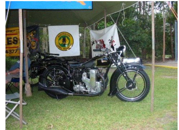
1934 600cc 4F-Owner Brian Fleming