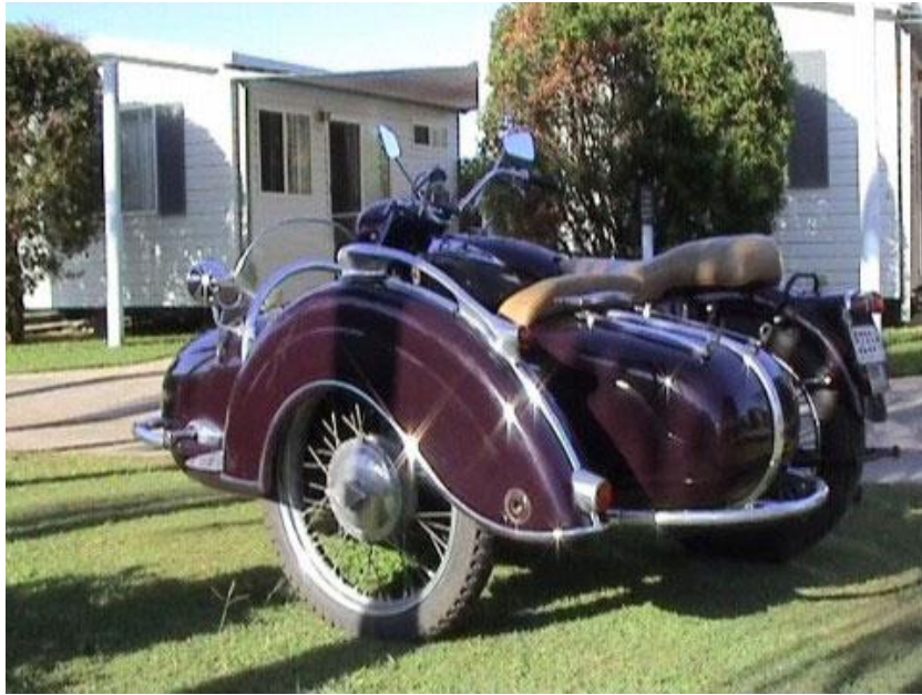
President's Choice- 1956 Sq.4 & sidecar