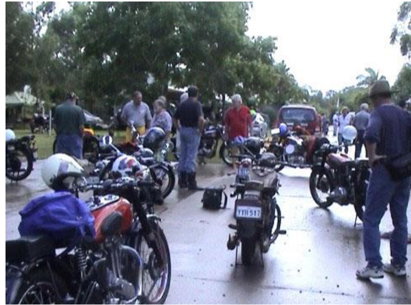
Raining on Saturday