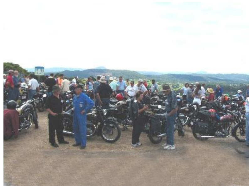
The Dulong Lookout