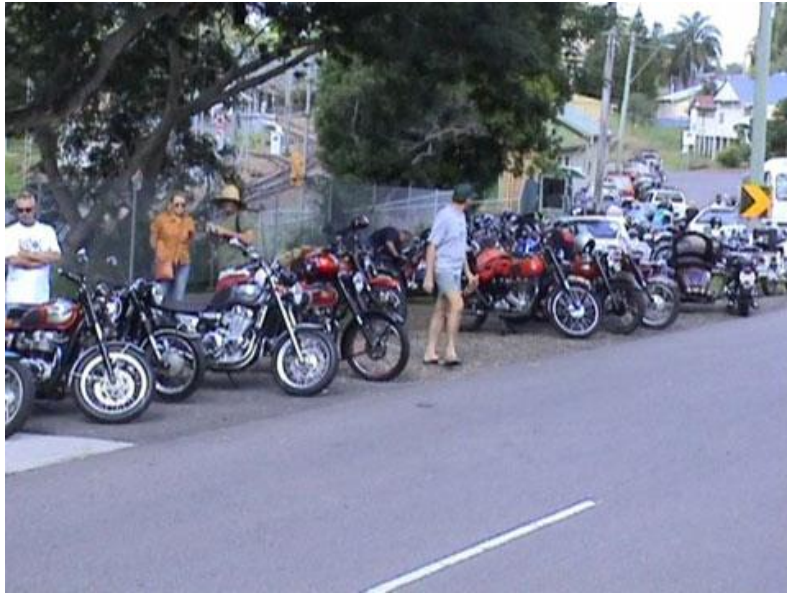
Main St. - Palmwood